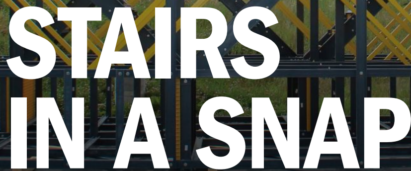
Photo of assembled stair tower prepared for shipment.

Don't wait for a custom build when you don't need one. Take your safety and productivity needs to the highest level with ReadyStair stair towers from Bedford. ReadyStair sections are also used in conjunction with ReadyPlatform materials to meet any configuration need.